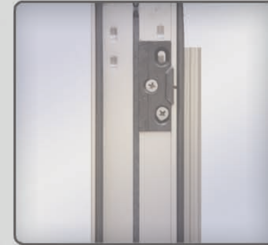
Concealed Multi-Point Lock

Glazing Bead w/ One-Piece Gasket and Bead EDPM Gasket Concealed Multi-Point Lock (Over 40") Male-Female Frame Connection