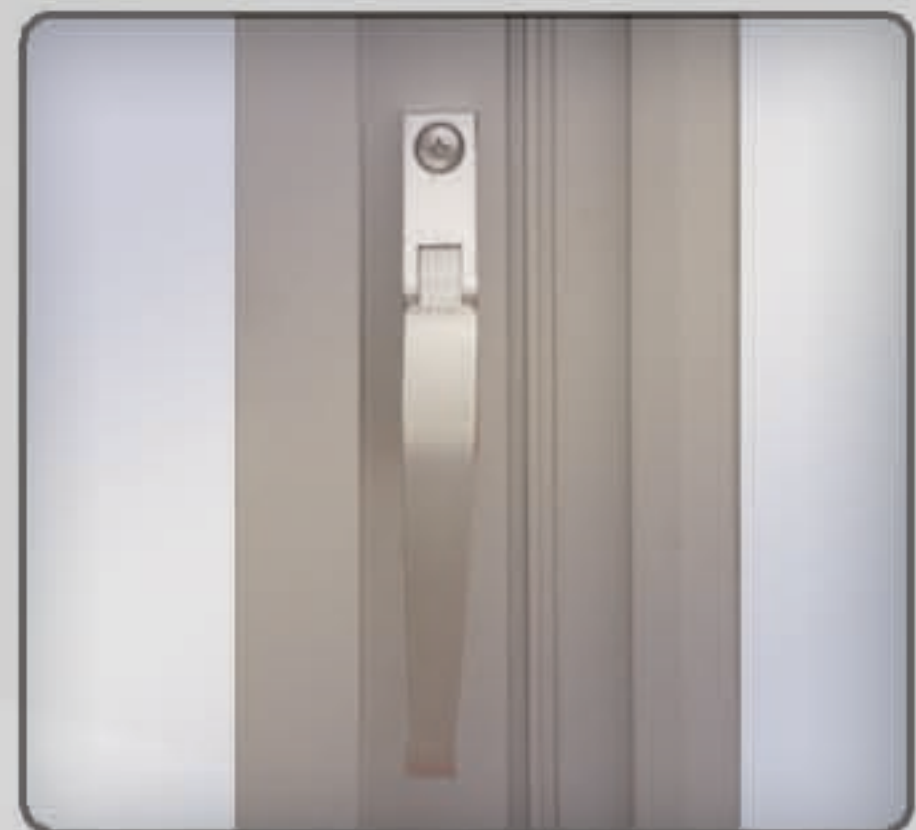
Optional Lift Handle